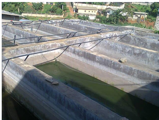
Plate 1 : Concrete fish ponds