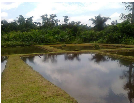
Plate 2: Earthen fish ponds